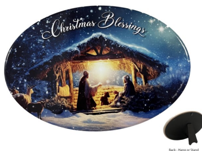
Back - Hang on Stand